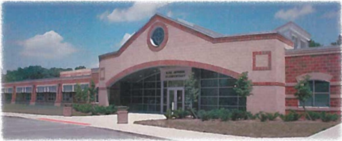
Kae Avenue Elementary